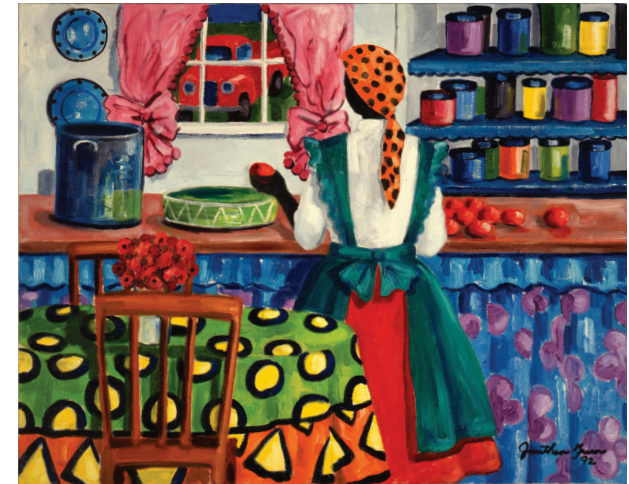
Red Tomatoes , 1992, Oil on Canvas, 16" x 10" © Jonathan Green

Claiming Your Health by Claiming Your History